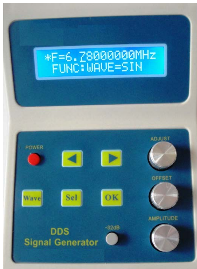
Fig. 1: DDS generator of the Scalar Wave Transporter SWT

The second line should show FUNC:WAVE=SIN, because the use of a sine as a waveform is recommended. With the button [Wave] the setting can be switched to TRI (triangle) or to SQR (square). Subsequently SIN (sine) shows up again.