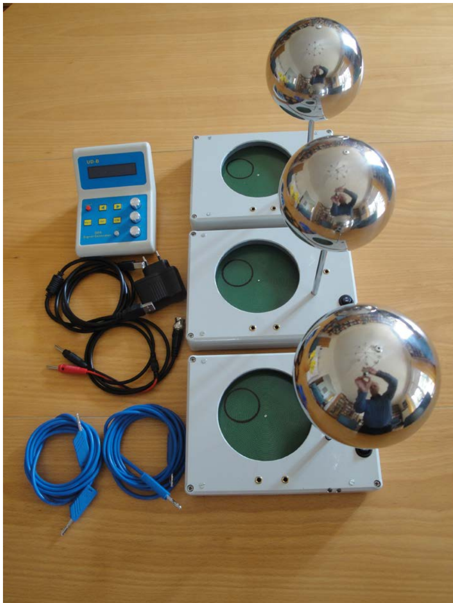
Figure 3: Delivery contents of the scalar wave transporter SWT