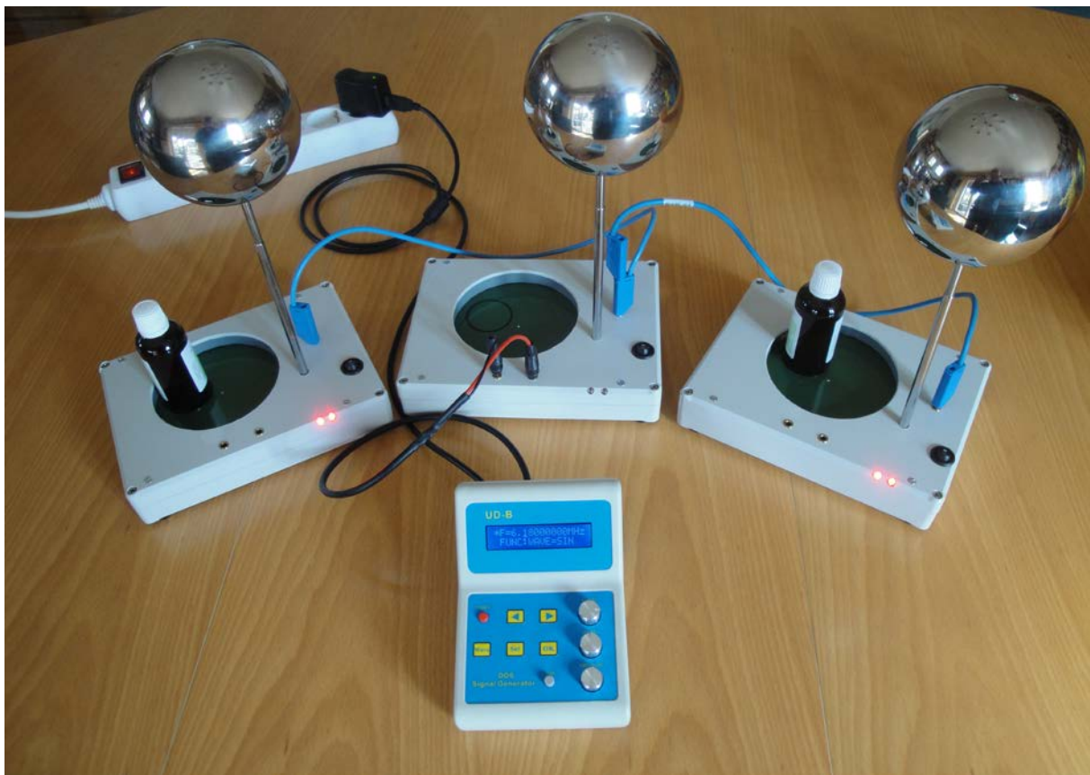
Figure 6: Experimental setup of the scalar wave transporter SWT

This setting should be saved now (as described on page 21) and if necessary readjusted before each new attempt. The quartz crystal is a great help to stabilize the frequency, especially for comparative experiments with the same setup as condition.