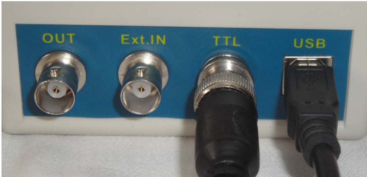
Fig. 2: Connector block of the DDS generator (on the back)

On the back of the DDS generator are the following connections from right to left: